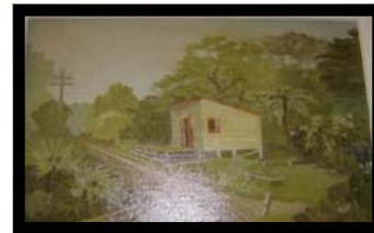
The BBQ Stop - Painting by Gay Heald